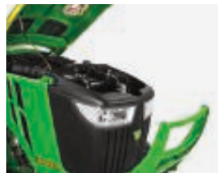
Easy to maintain and service.