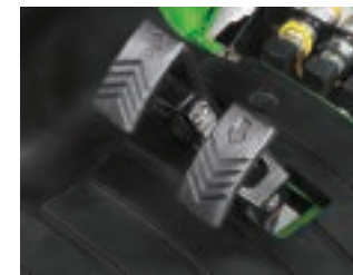
Forward/Reverse Twin Touch™ Pedals.