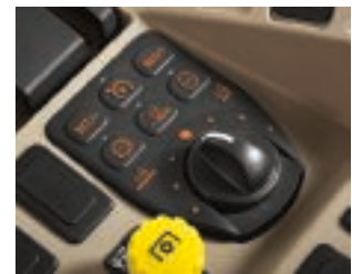
Intuitive dashboard controls.